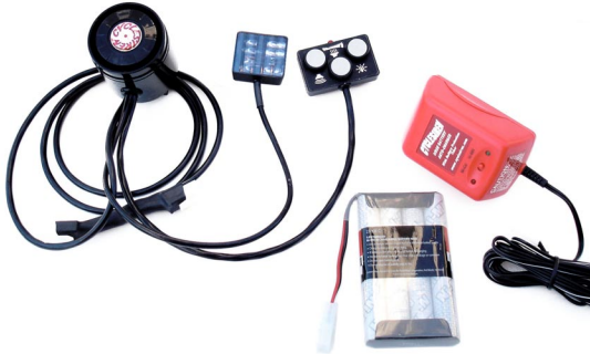
THE SIREN SYSTEM (Trooper model shown)

CycleSiren is the Full Featured Bike Patrol Siren for Law Enforcement and EMS Please Visit Our Web Site at www.cyclesiren.com