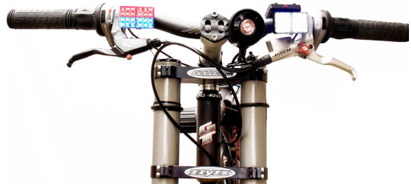
PATROL RED/BLUE COMBO & WHITE The white LED streetlight is rated at 500 candela

NOT ALL SIREN MODELS AND ACCESSORIES ARE SHOWN. OTHER COLOR LIGHTING COMBINATIONS ARE AVAILABLE. FOR MORE DETAILS AND SPECIFICATIONS ON OUR SIRENS, PLEASE VISIT OUR WEB SITE AT WWW.CYCLESIREN.COM