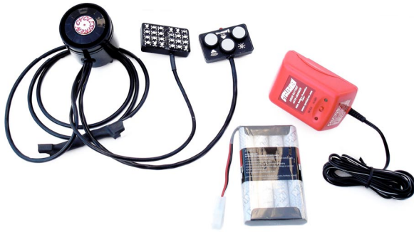
THE SIREN SYSTEM (Trooper model shown)