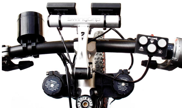
OPTIONAL SWING-GRIP MOUNT SHOWN IN CENTER