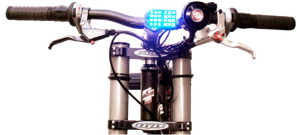
TROOPER ALL BLUE