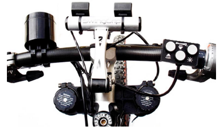
OPTIONAL SWING-GRIP MOUNT SHOWN IN CENTER