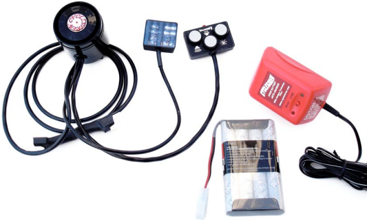
THE SIREN SYSTEM (Trooper model shown)

CycleSiren is the Full Featured Bike Patrol Siren for Law Enforcement and EMS Please Visit Our Web Site at www.cyclesiren.com