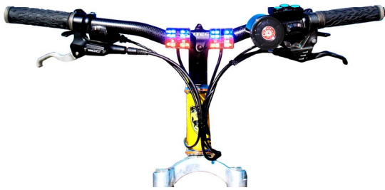
PATRIOT DUAL RED/BLUE & RED/BLUE PATRIOT ALL RED & ALL BLUE Also available in red/white (EMS)