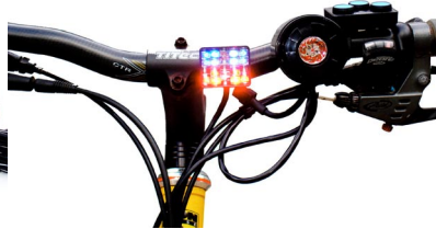
TROOPER RED/BLU Also available in all blue or red/white (EMS)